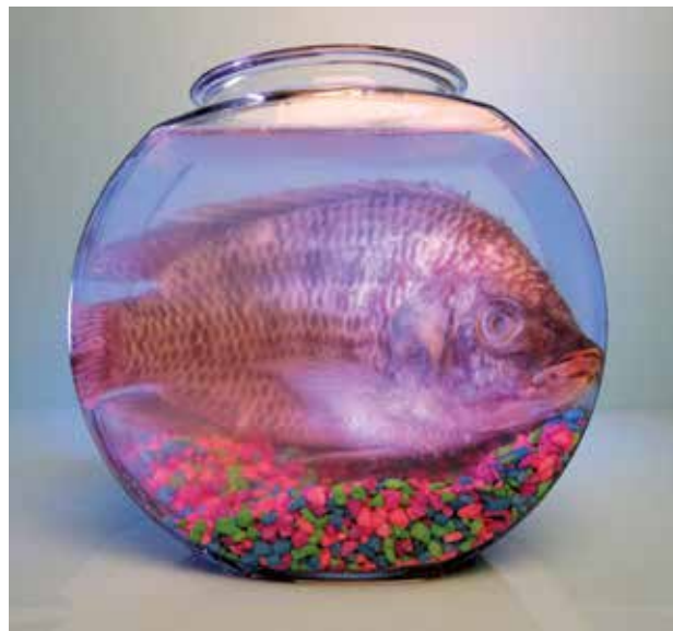
A branch is too big to come out of a twig