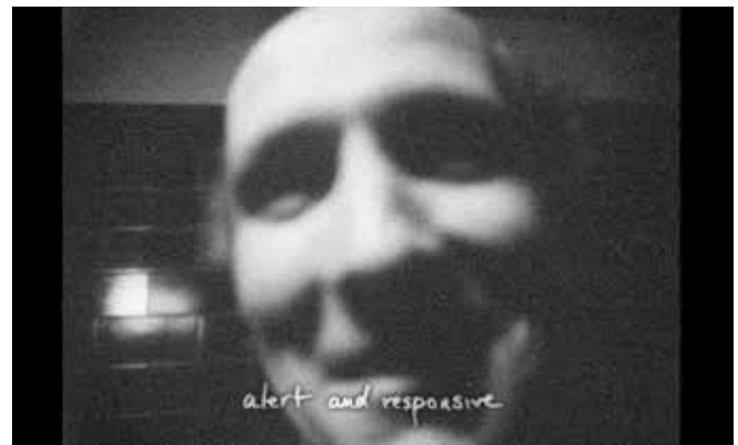
Buffalo Death Mask