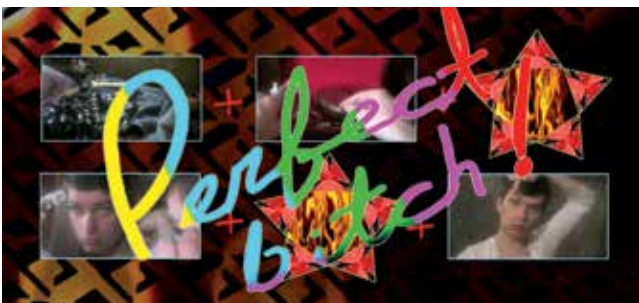
The Church of Feel Good

The Church of Feel Good teaches us how to reach out beyond the mundane entrapments of modern living and grab onto the divine satisfaction we so deserve. A loving homage to 1980's direct to VHS lifestyle videos, this short film by Jason Penney goes beyond the self help and actualization movement mumbo jumbo and presents us with a step by step method of learning how we can have ourselves a plausibly good time or a close enough approximation. Watch in shock, awe, and glee as we take the reigns of control and make ourselves and loved ones into the stars of our own reality.