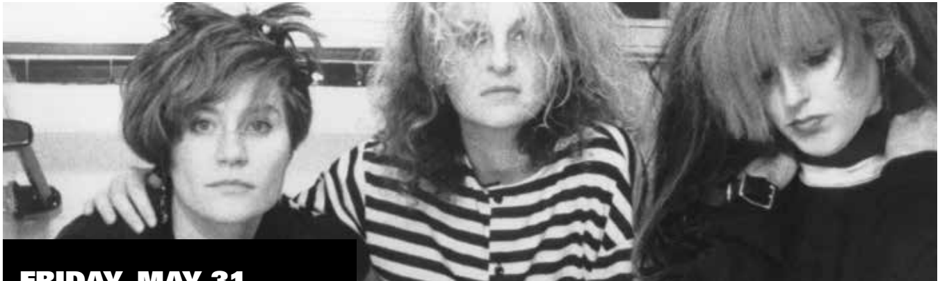
She Said Boom: The Story of Fifth Column