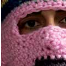
Cuki Colorinchi Evolution