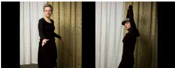
The Brand Album

An exploration of Butch Lesbian identity, with a description of the curious side trip of exploring the possibility of transitioning to male. Spahn rides back and forth on the same route to highlight the ambivalence of one genderqueer's journey to an identity s/he feels comfortable with.