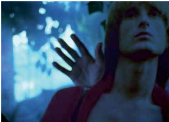
Encounters I May Or May Not Have Had With Peter Berlin

Encounters I May Or May Not Have Had With Peter Berlin deals primarily with monumentality, narcissism and the ways in which our heroes are embedded into our identities, and manifested through the body. Through a variety of gestures, the pervasiveness of this practice is highlighted alongside its ultimate, inevitable failure. The viewer moves through various stages of anxiety, idolization and actual touchdown with 70's gay sex icon Peter Berlin himself, capturing both the apparent and the hidden. The film guides the viewer through the process of making contact with a figure who exists only in his own photographs.