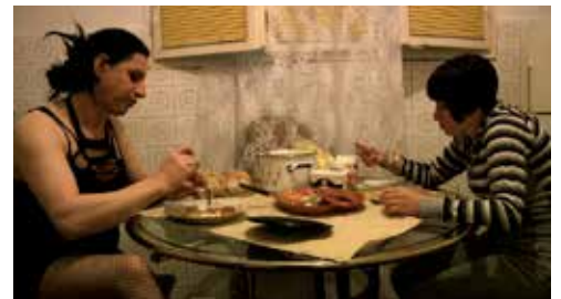
When I was a Boy, I was a girl