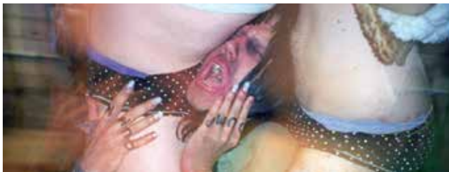
African Mayonnaise (P4)