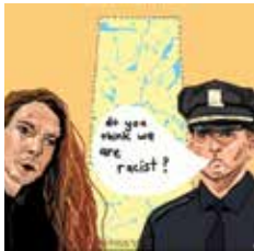
Where We Were Not