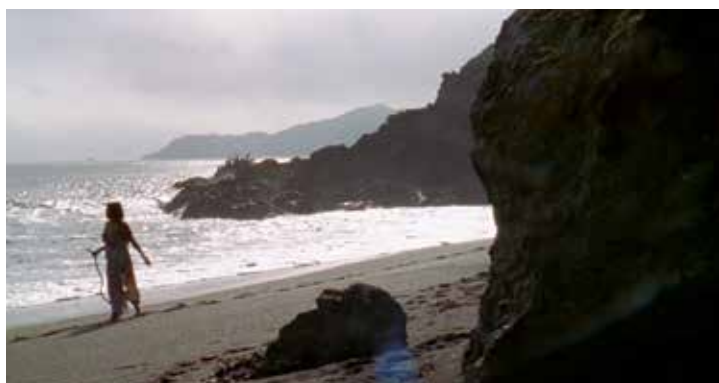
Circle in the Sand

In a broken near future, a band of listless vagabonds ambles across a war-torn coastal territory, supervised and sorted by a group of idle soldiers. Rummaging, stuttering, and smashing through the leftovers of Western culture, these ragged souls conjure an unstable magic, fueled by their own apathy and the poisonous histories imbedded in their unearthed junk. Suspicion, boredom, garbage, and glamour conspire in the languid pageantry of ruin. Feel the breeze in your hair, and the world crumbling through your fingers.