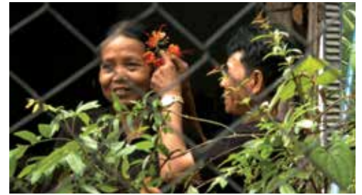
Two Girls Against the Rain

A captivatingly courageous and touching film about a lesbian couple in Cambodia. The two women have known and loved each other since the time of the Khmer Rouge. The deep bond existing between them and their strength have helped them overcome all different kinds of resistance, including that of their families.