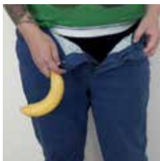
Boi Oh Boi

Homo-Made in Saskatchewan. Queer City Cinema is proud and excited to be able to showcase the work of several local artists. This program is a mix of documentary, experimental, personal narrative, and drama – diversity as an expression of the great and special place we call home. Directors in attendance with post-screening chat and reception.